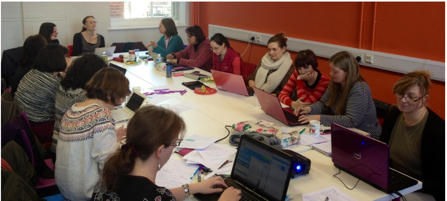
Webchat training in London in February

There has also been a lot of interest from helpers, so we're looking at ways we can get others involved too. Watch this space for more info.