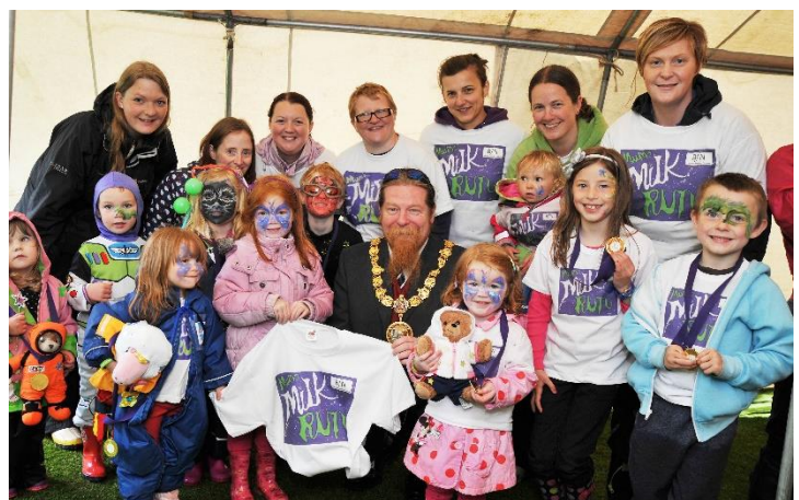
Mums' Milk Run 2013 in Kilmarnock, Ayrshire